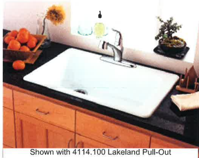
Shown with 4114.100 Lakeland Pull-Out Kitchen Faucet